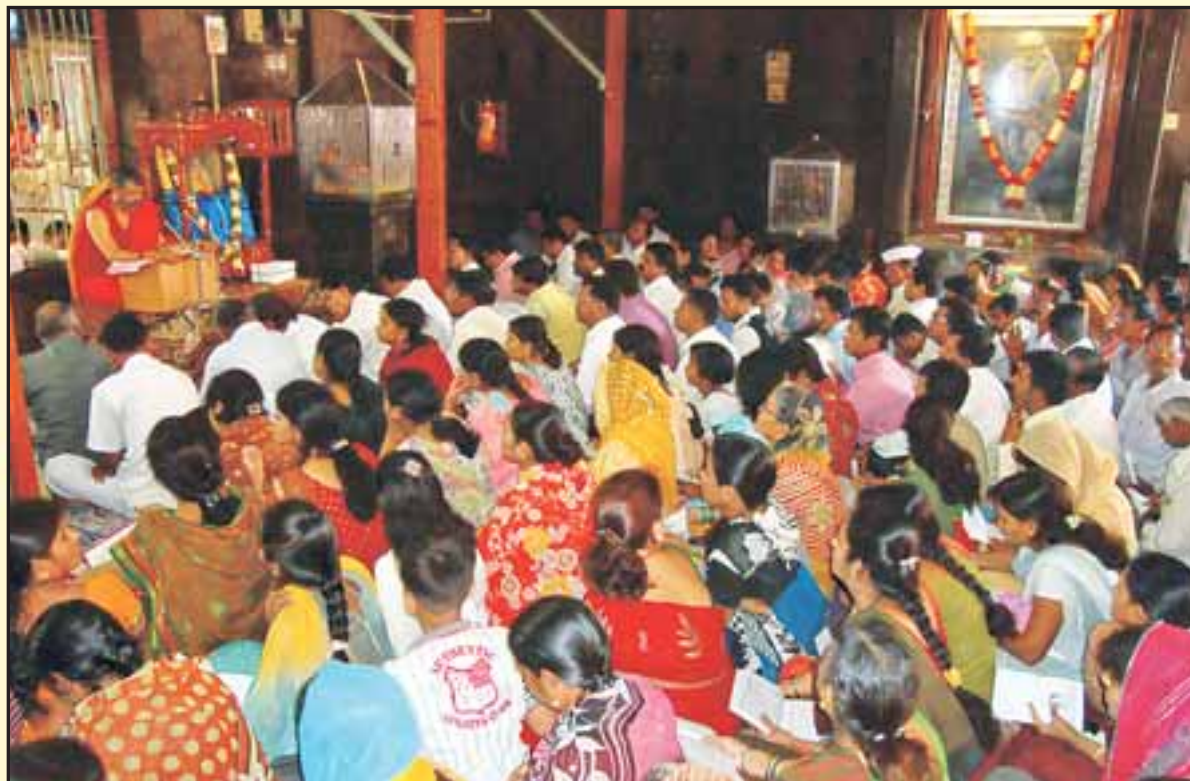
Sai devotees engrossed in joint recital of the 11 th chapter from Shri Sai Charitra in Dwarkamai on unique 'muhurta' on 11-11-2011