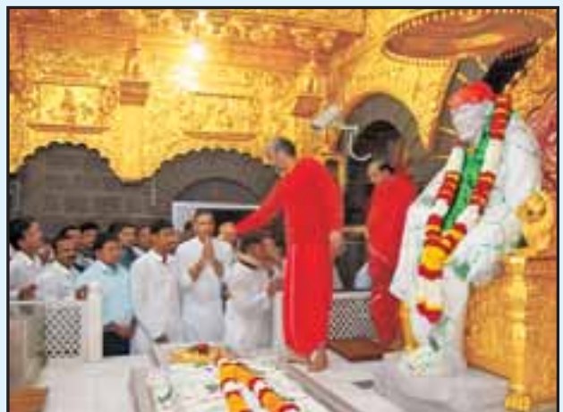
Cricketer VVS Laxman takes Shri Samadhi darshan.