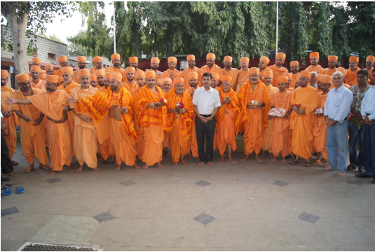
Tuesday, 1.10.2013 : Sadhus from Swami Narayan Mandir, Gujarat