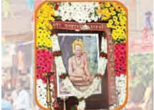
Shri Akkalkot Swami Samarth Maharaj Math, D.L. Vaidya Rd., Dadar West, Dist. Mumbai, Maharashtra State