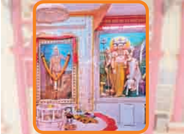
Shri Swami Samarth Math, Khadilkar Rd., Girgaon, Charni Rd. East, Dist. Mumbai, Maharashtra State