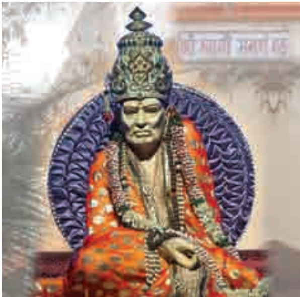
Shri Swami Samarth Math, Nandivli, Dombivli East, Tal. Kalyan, Dist. Thane, Maharashtra State