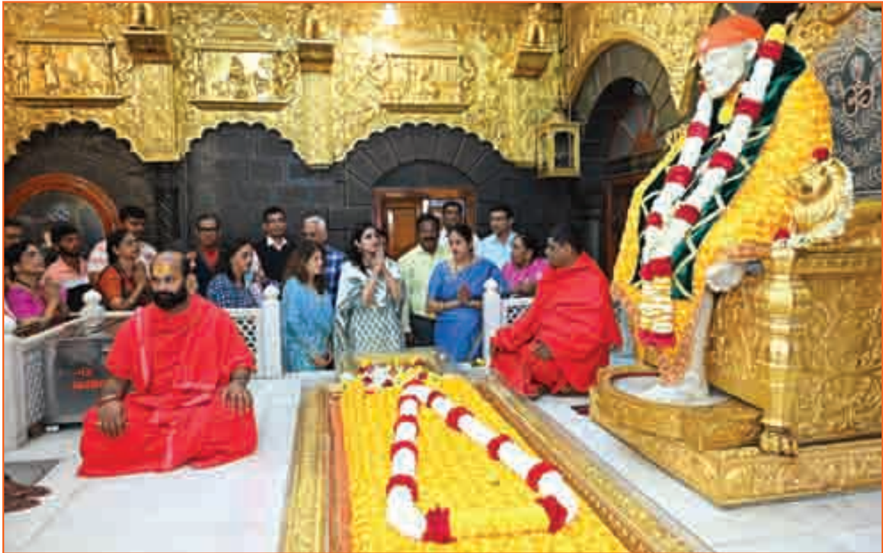
Smt. Raveena Tandon, actress, availed the darshan of Shri Sai Baba's Samadhi ...