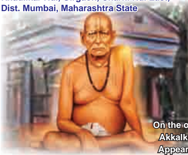
On the occasion of Akkalkot Swami Appearance Day