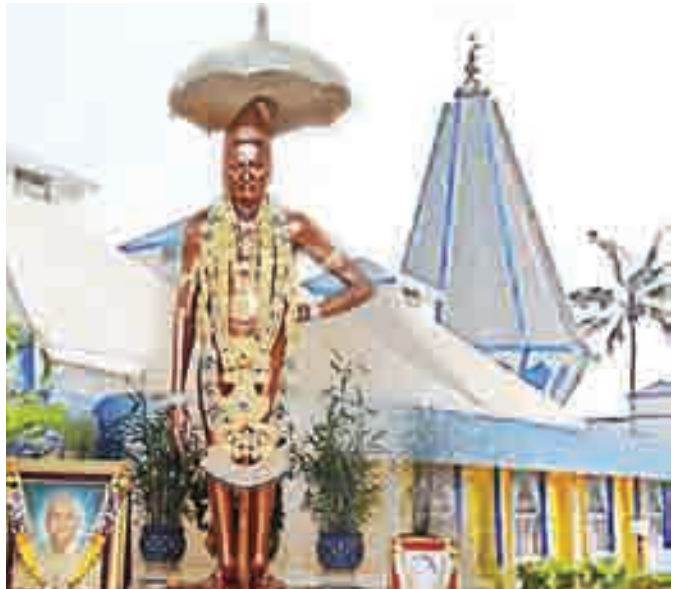
Swami Bhavan, Nangargaon, Lonavala, Dist. Pune, Maharashtra State